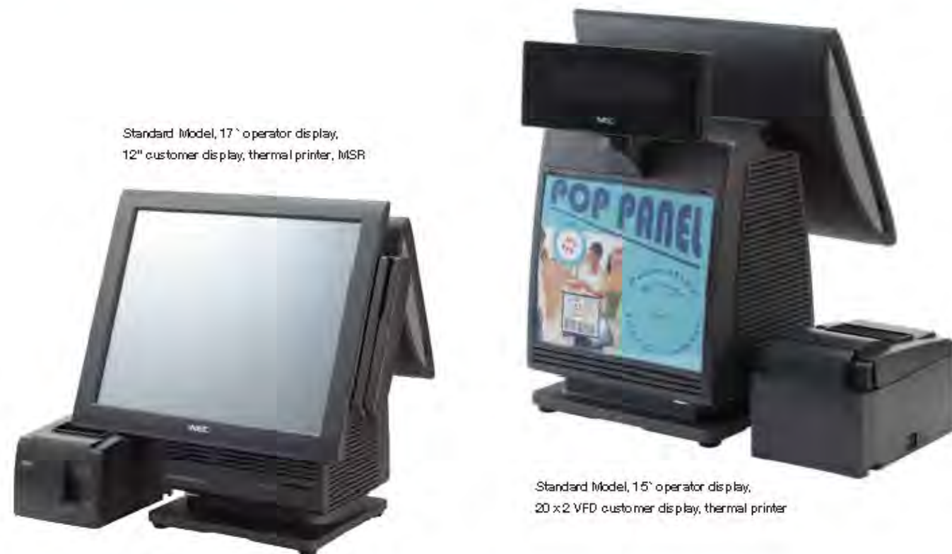
Standard Model, 17" operator display, 12" customer display, thermal printer, MSR