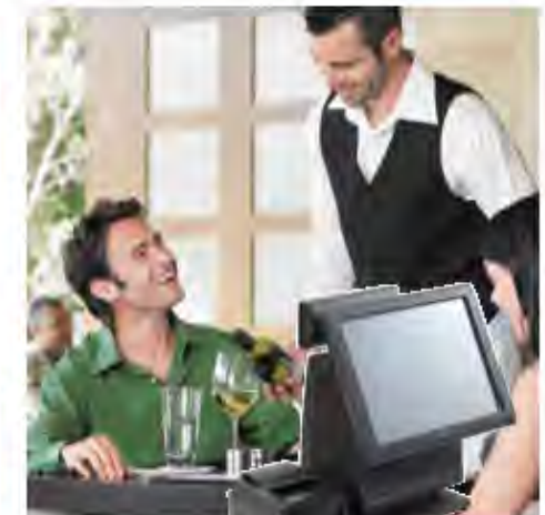
Fanless SSD Model 15" operator display, 20 x 2 VFD customer display, thermal printer

A fanless motherboard, compact footprint, SSD option and large touch screen perfectly meet the requirements of harsh store environments in the F&B industry.