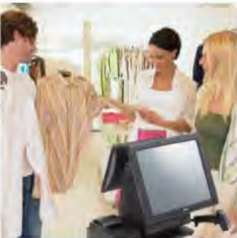
Standard Model 15" operator display, 12" customer display, thermal printer, handheld barcode scanner

TWINPOS G5 offers the smallest footprint of any dual LCD system. You can play promotion movies on the customer LCD to attract store guests as a digital signage solution.