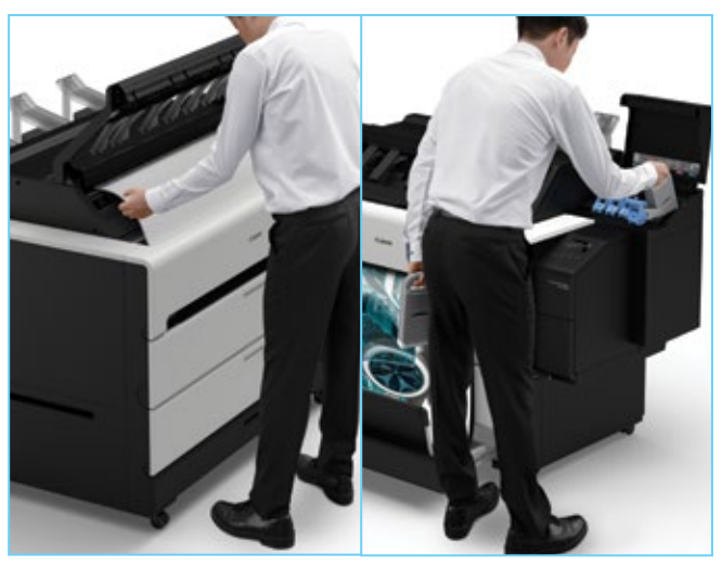
Top Delivery Tray