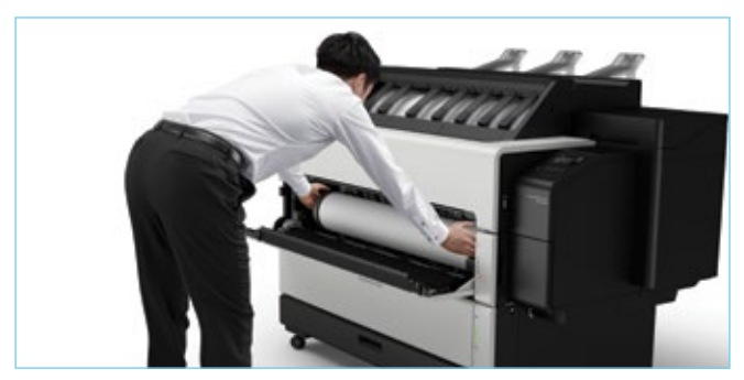
Hot-Swap Roll Replacement