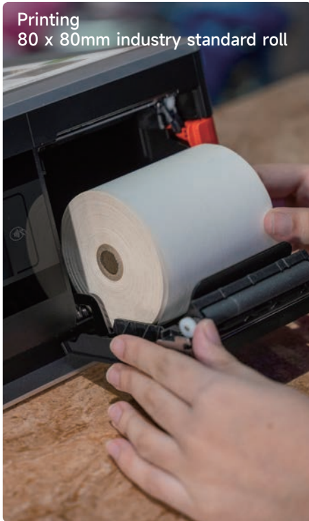
Printing 80 x 80mm industry standard roll