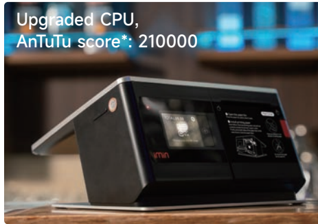
Upgraded CPU, AnTuTu score*: 210000